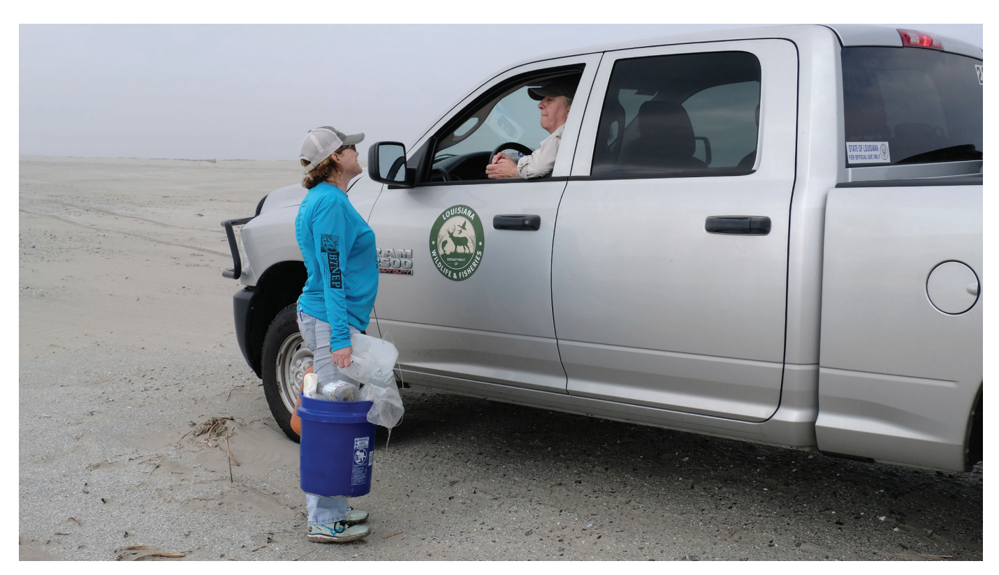
BTNEP staff member working with LDWF on Marine Debris Removal.