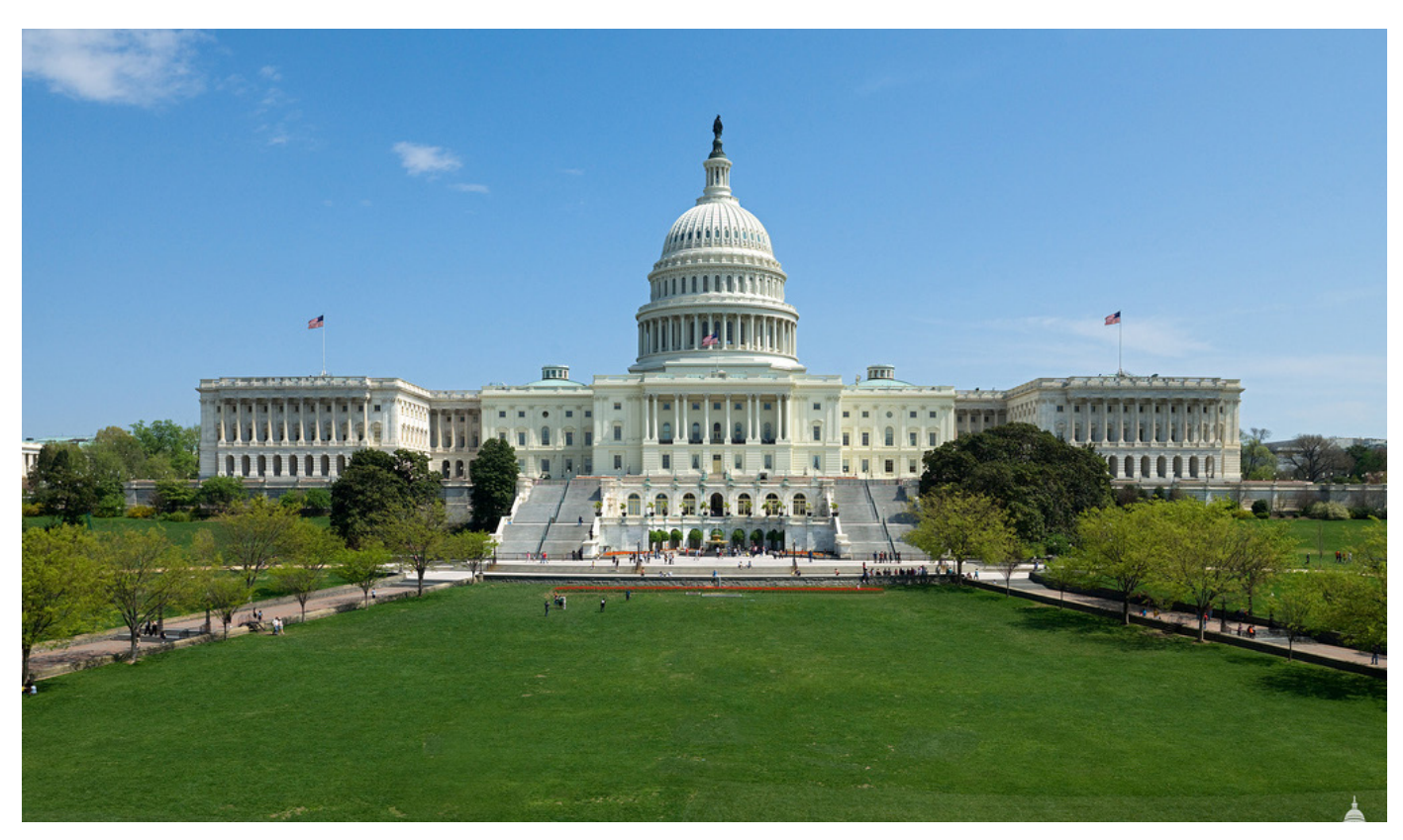
United States Capitol building.

in associations and organizations with similar goals and interests, conference fees, the development, production, and distribution of educational and informational materials, and the implementation of an annual town-hall style event. Costs incurred may range from $25,000 to $75,000 per year.