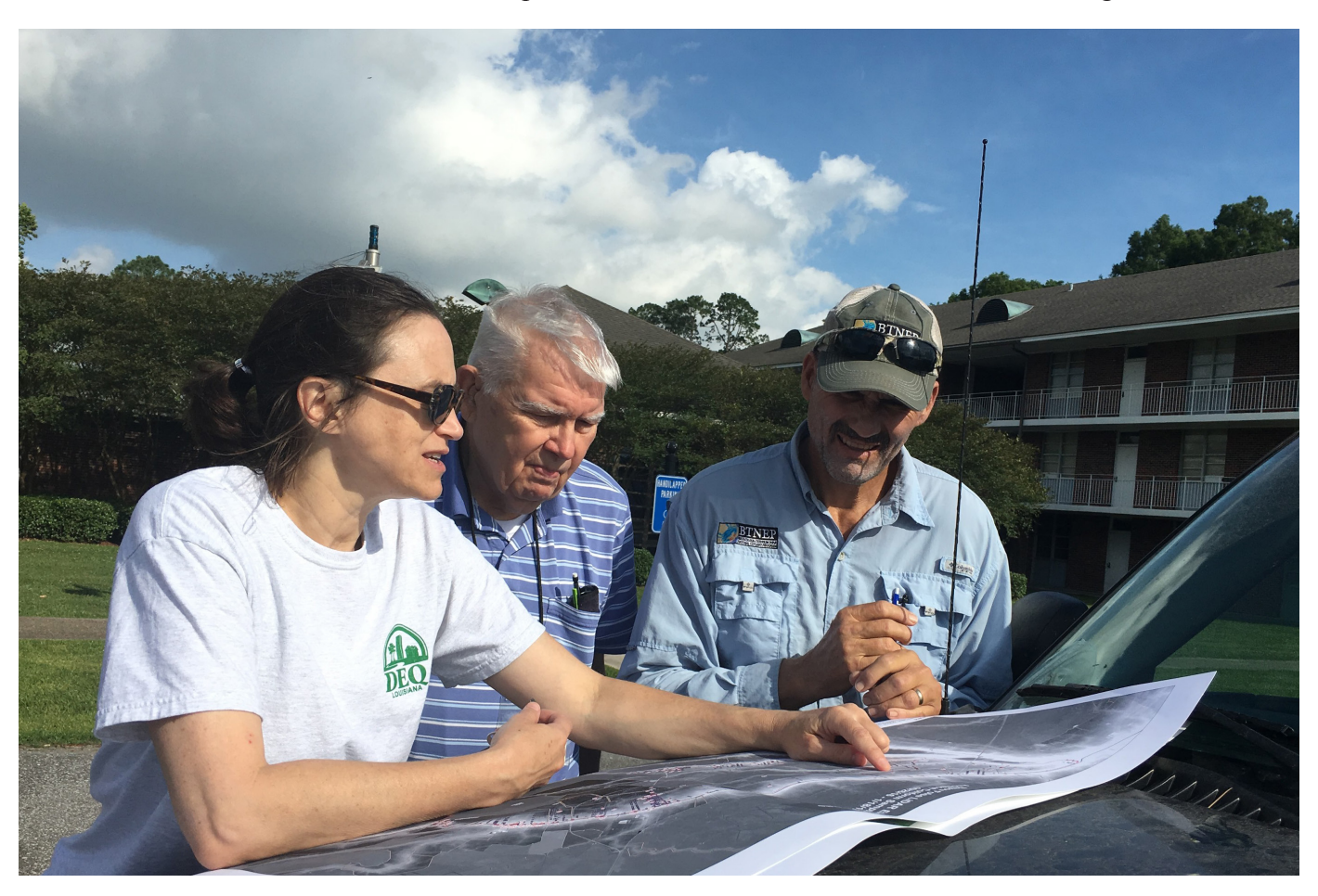
BTNEP staff member works closely with DEQ BTNEP MC members on water quality improvements.