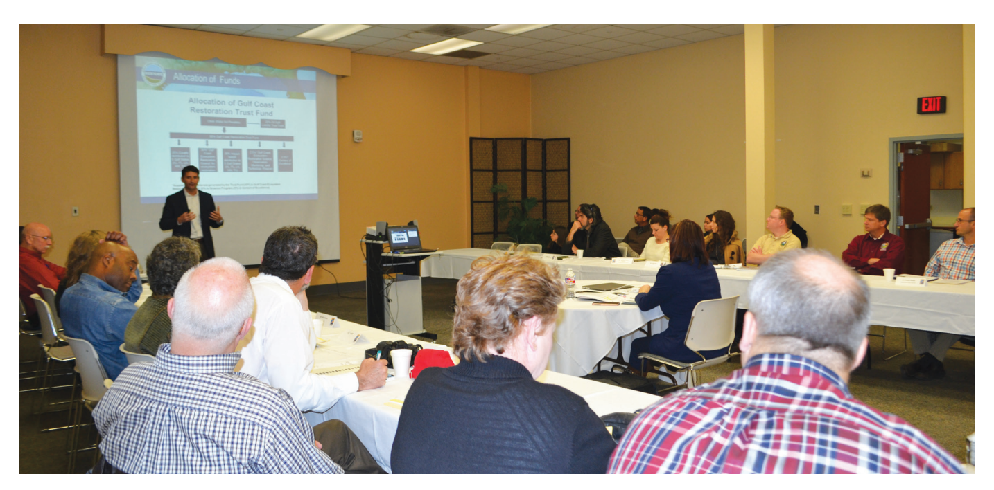
BTNEP Management Conference meeting.

Making the officials aware of the community needs as a whole, not just one perspective, is important for fair and balanced decision making.