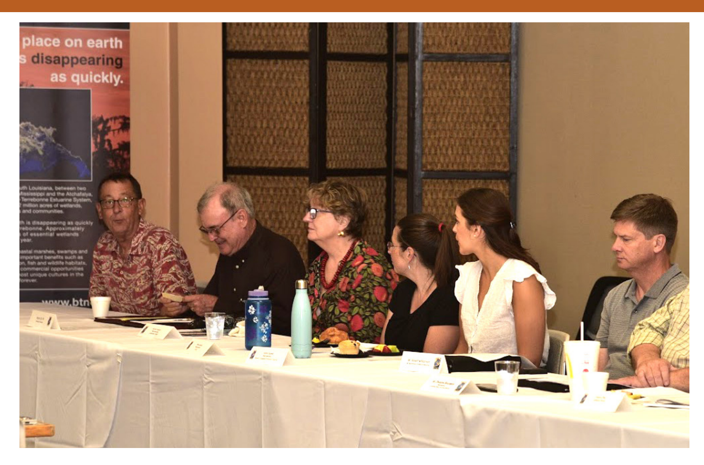
BTNEP Management Conference.

with these efforts to ensure that all ongoing activities support the goals of the CCMP.