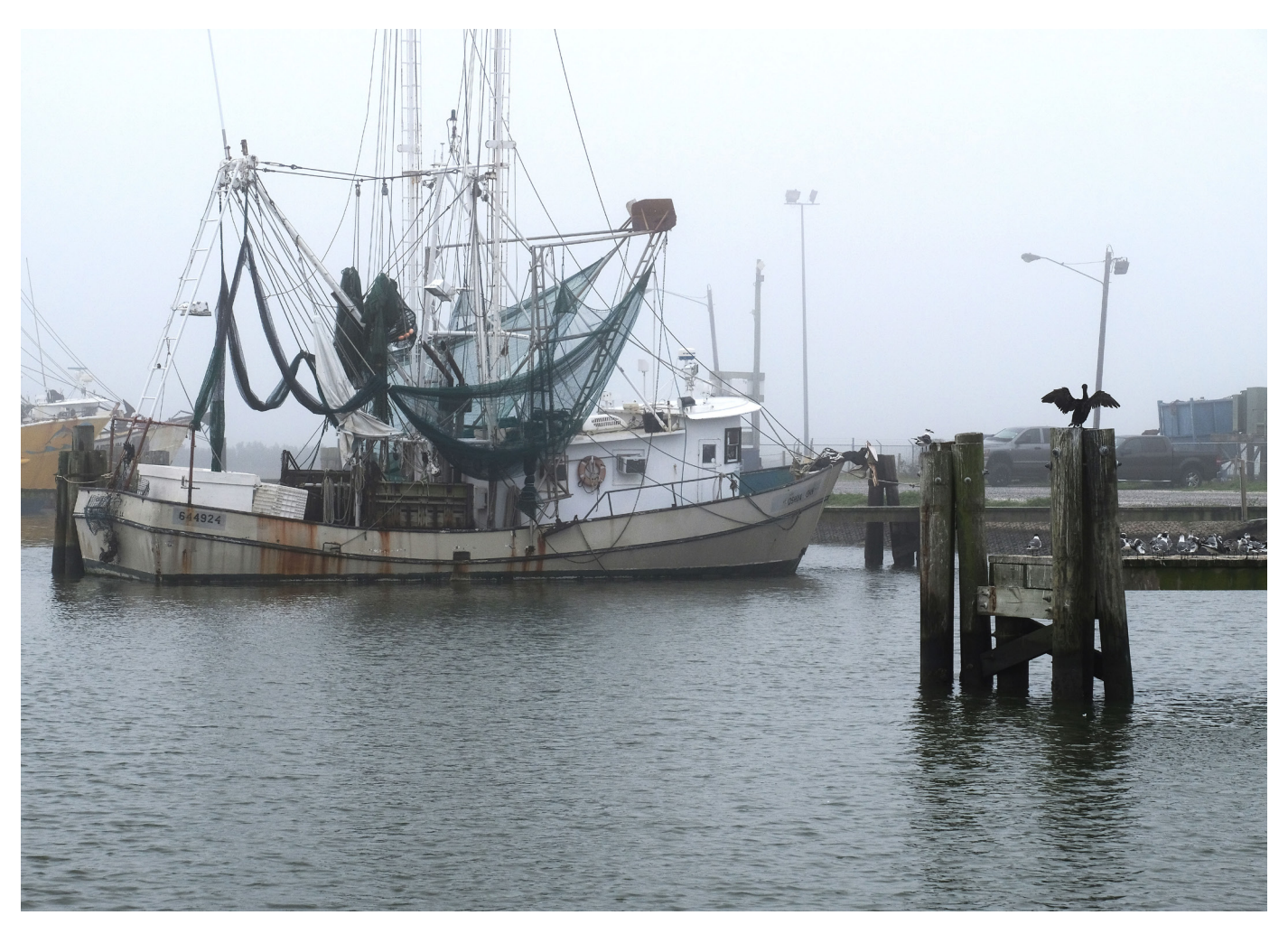
Shrimp boat at dock.

and the life of the CCMP with milestones, costs, and performance measures to meet. The intent of this Action Plan varies from the traditional Action Plans in that it will serve only as a guide to the BTPO in the event of an extreme event that may result from meteorological, geological, man-made, or other source. When these events occur within the BTES, local, state, and federal agencies activate to fulfill emergency operations roles which support the Federal Emergency Management System (EMIS). Some of these agencies' key personnel and functions are represented by BTNEP MC members; however, some are not. This Action Plan, when needed, will serve as a way to account for the value added by the BTNEP staffs' ability and flexibility to fill in the gaps