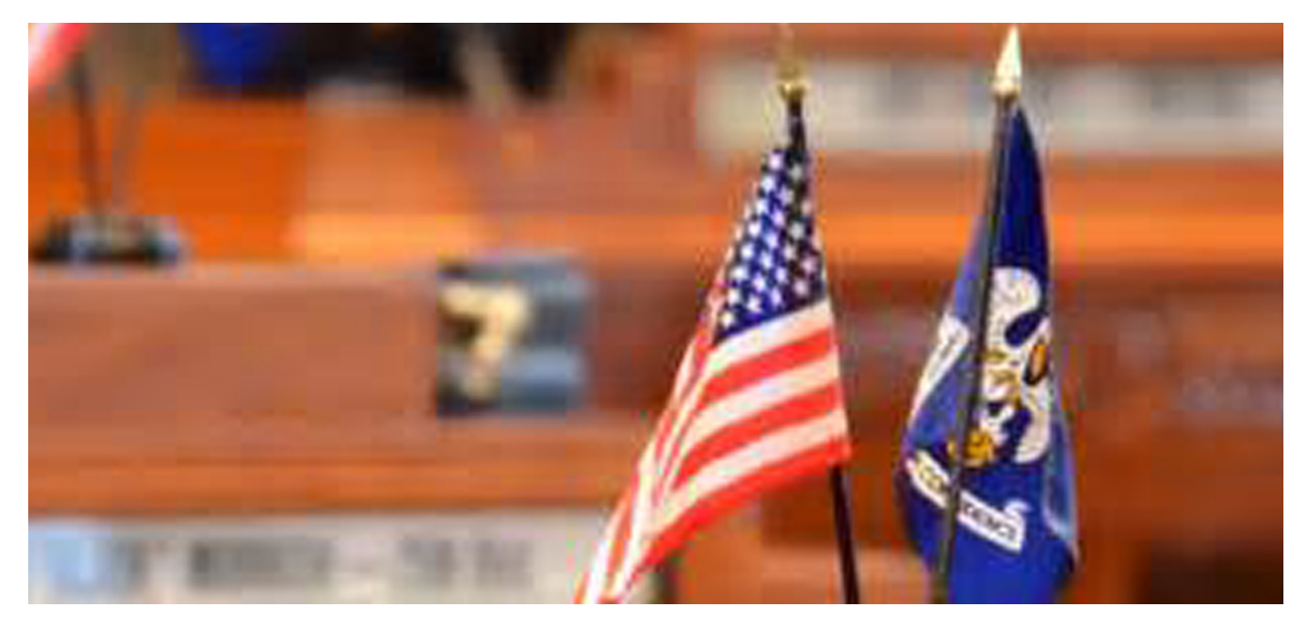
Flags of the U.S.A. and Louisiana on the desk of a state legislator.

Generally, Action Plans of the CCMP serve as guides for BTNEP to work on throughout the year