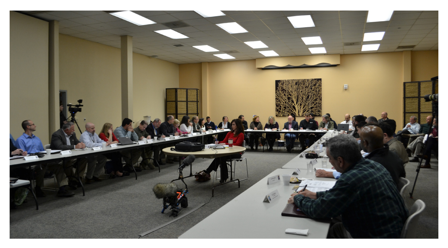
BTNEP Management Conference.