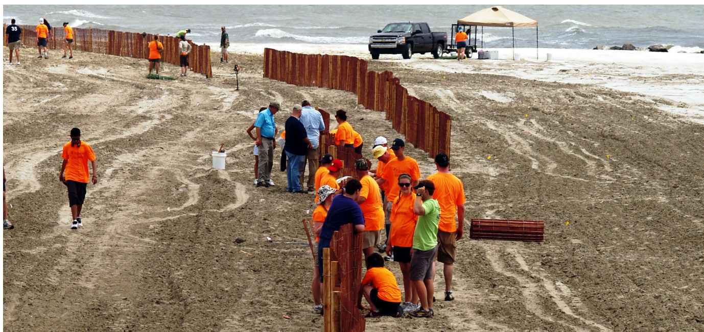
Volunteer groups work to protect barrier shorelines that also help protect culture.

The adaptive capacity of these communities has been honed over many generations of living and working in this dynamic and ever changing environment. Consequently, the regional geography and geology, particularly the health of barrier islands, breadth of protective marshes and swamps, and the ecological integration and maintenance of the natural levees, often promote or add to the overall resilience of