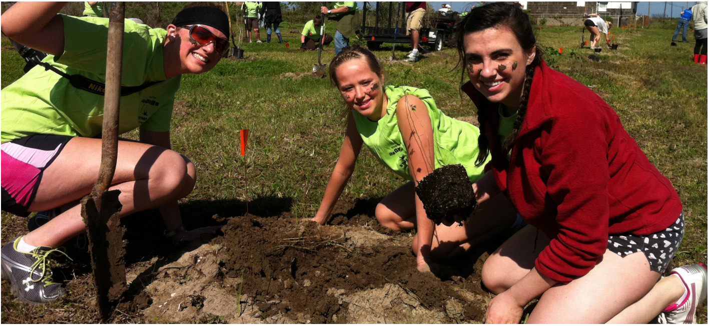
BTNEP provides financial support for informal education and volunteers.