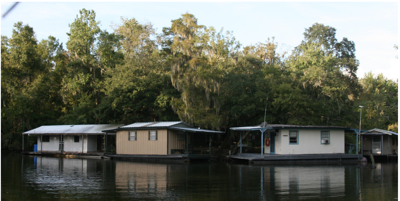
Houseboats near Bayou Felix.

The goal of this group of Action Plans is to remind everyone that we are saving this estuary for the