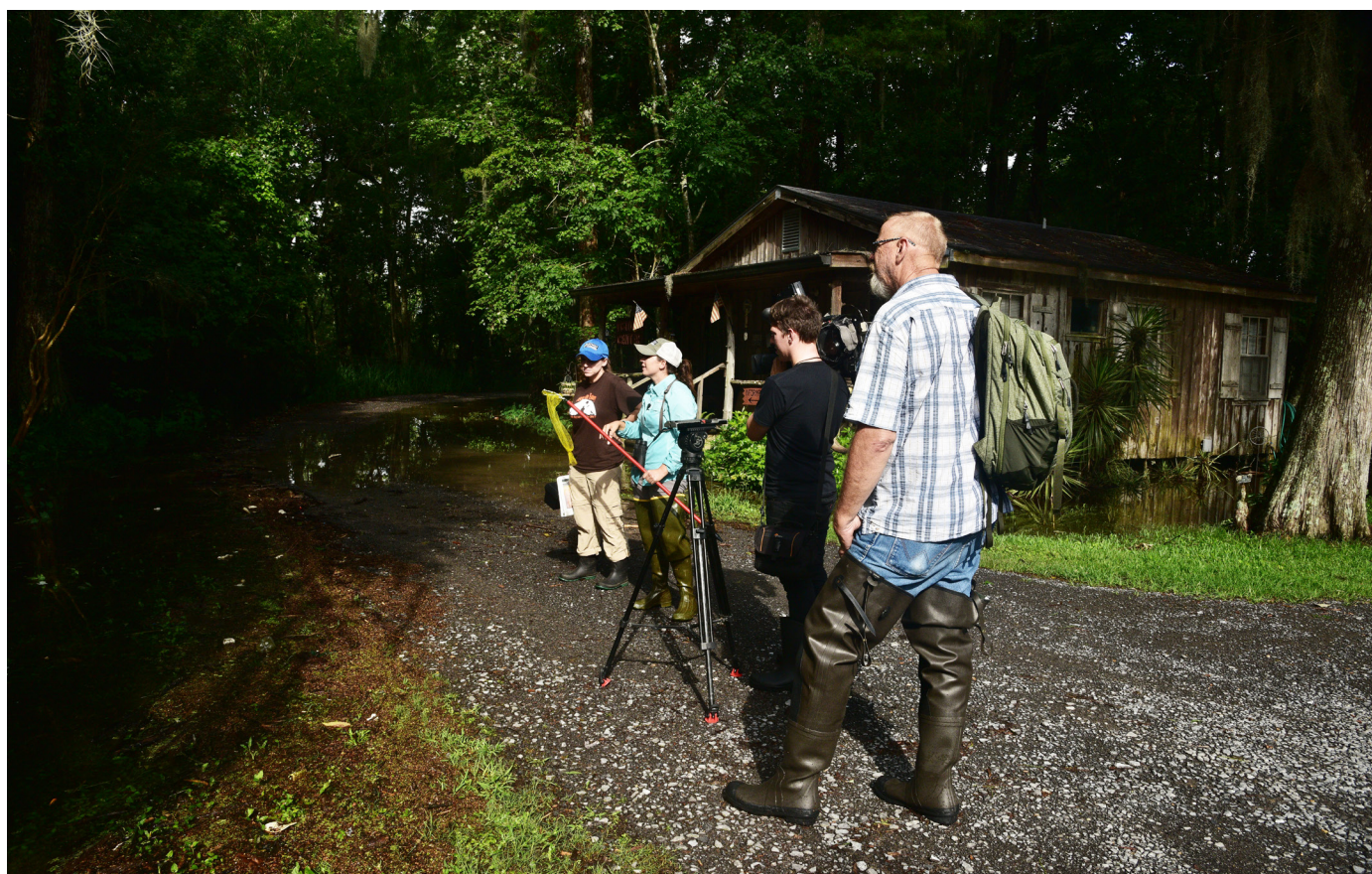
BTNEP scientists and public relations coordinator work with media.

The total range of funding necessary annually for