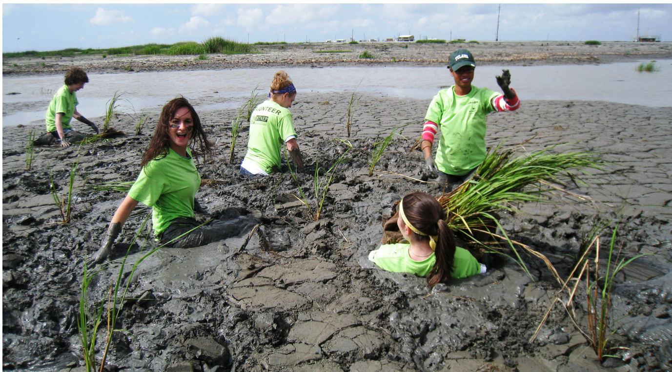
Student volunteers working on vegetative planting.

encouraged through this Action Plan. APT meetings, public meetings, and workshops provide other avenues for public forums.