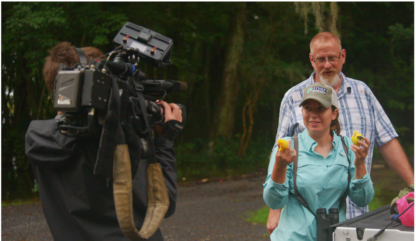
BTNEP scientists discuss the value of healthy bird habitat with media.

To facilitate a true understanding of the BTES and the program’s message, the public must have an opportunity to participate in two-way communication. The BTPO has used a 1-800 number in the past to