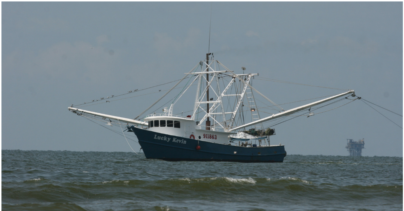
Traditional offshore shrimp boat.

and genealogical societies, arts councils, and crafts guilds) could also organize activities such as art shows or photography exhibits in local museums, malls, or festivals and other community events.