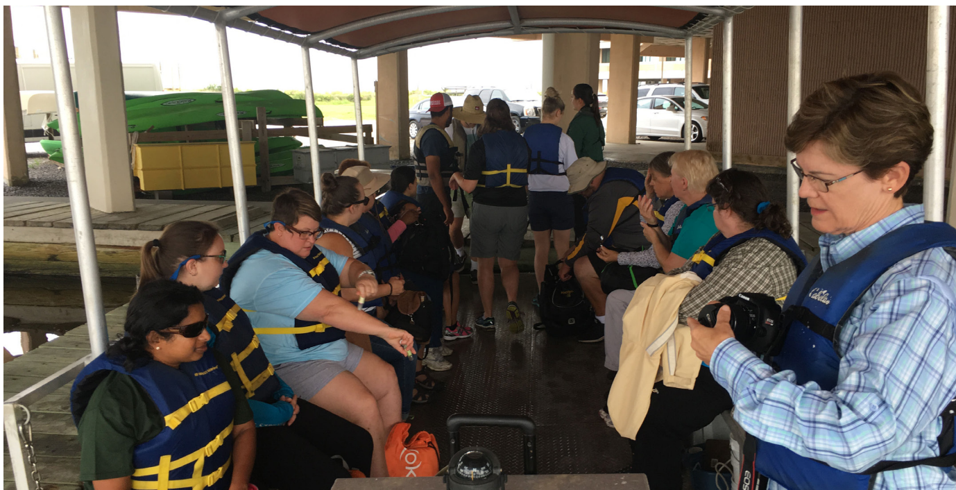
Teachers prepare for field session sponsored by BTNEP and LUMCON to learn about water quality.