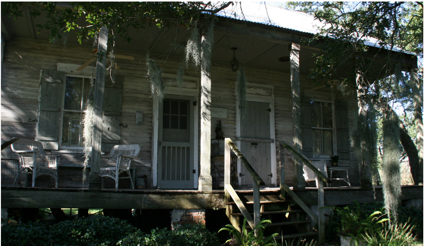
Traditional Cajun cottage.

Total Funding Necessary (Annually): $30,000 to $100,000