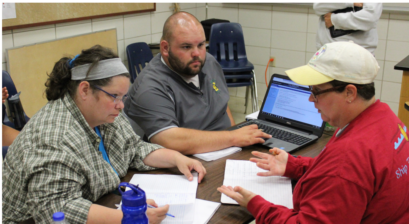
Teachers learn that environmental subtleties affect individuals who live and work in the area daily.

Many opportunities exist to highlight a linkage between the environment and the culture of the BTES. Largescale agency projects, collegiate academic research, parish libraries, regional schools, and summer camps offer the most logical means to organize and publicize culturally-based activities. Each has a number of resources including collections, archives, film, and others that could form the basis for developing activities. In addition, the schools and locally-based cultural organizations (i.e., the USNPS, the Nicholls Center for Bayou Studies, historical