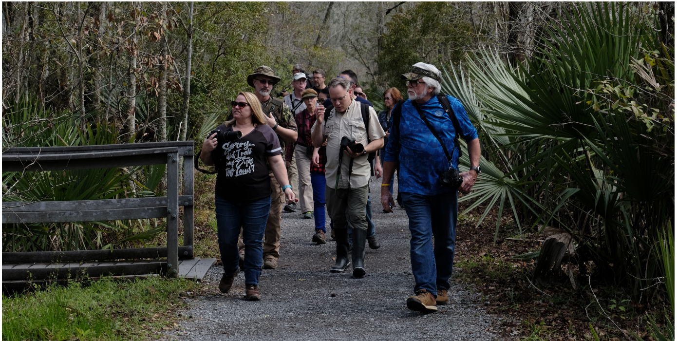
Public engagement in the field is an important part of outreach and engagement.

This Action Plan will serve to facilitate developing BTES constituents as stakeholders in the resources of the region. Developing stakeholders will produce an informed, concerned, and responsible citizenry, from children to adults, within the BTES. The population will become more literate in estuarine issues (i.e. climate change) as voters, harvesters, and developers. The educational programs will be recognized and used in estuarine education throughout the nation. Therefore, knowledge and appreciation of the BTES will be increased on a national level.