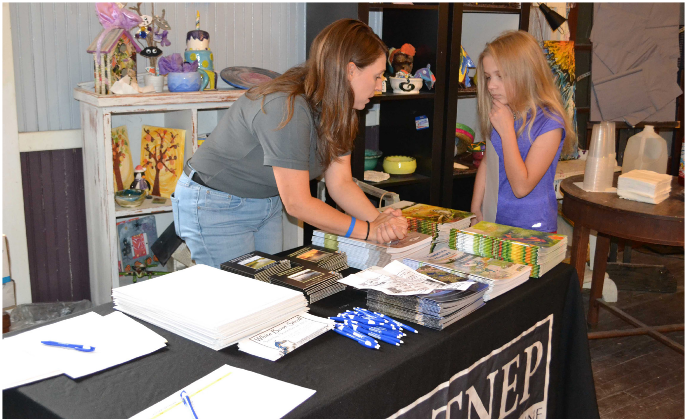
BTNEP staff members participate in a variety of continuing and informal education programs.