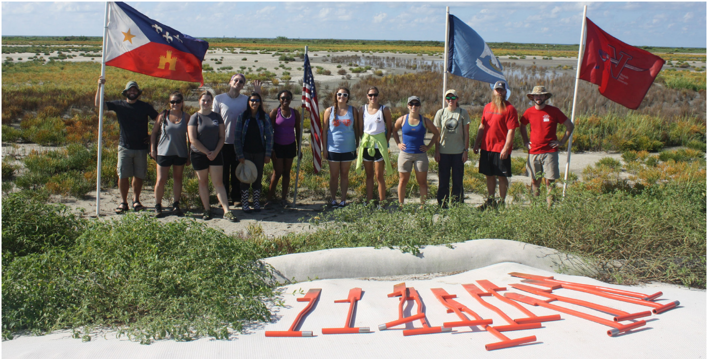
College students participate in restoration activities and learn that protecting ecosystems protects cultures