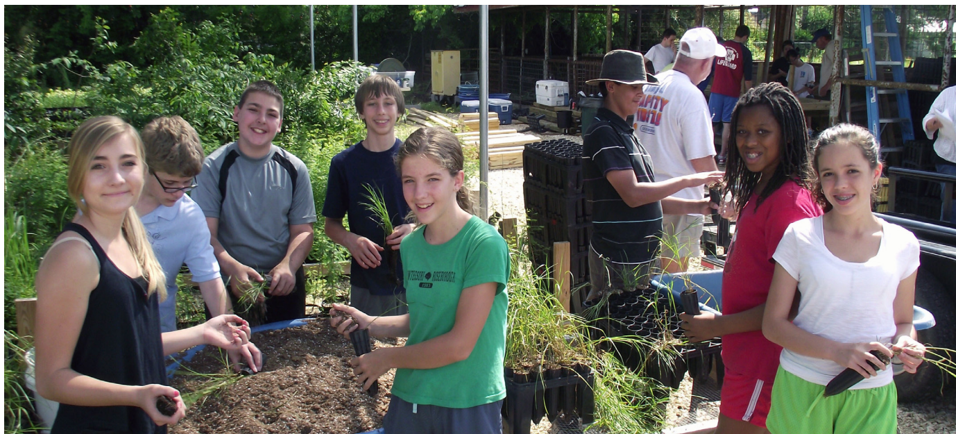
Student volunteers at the BTNEP plant propagation facility.

Historically, funds that have been secured have funded curriculum development, Environmental Education Symposiums, teacher workshops and other estuarine educational activities. BTNEP recently received a grant from the Louisiana Environmental Education Commission in order to host a WETMAPP Workshop for teachers.