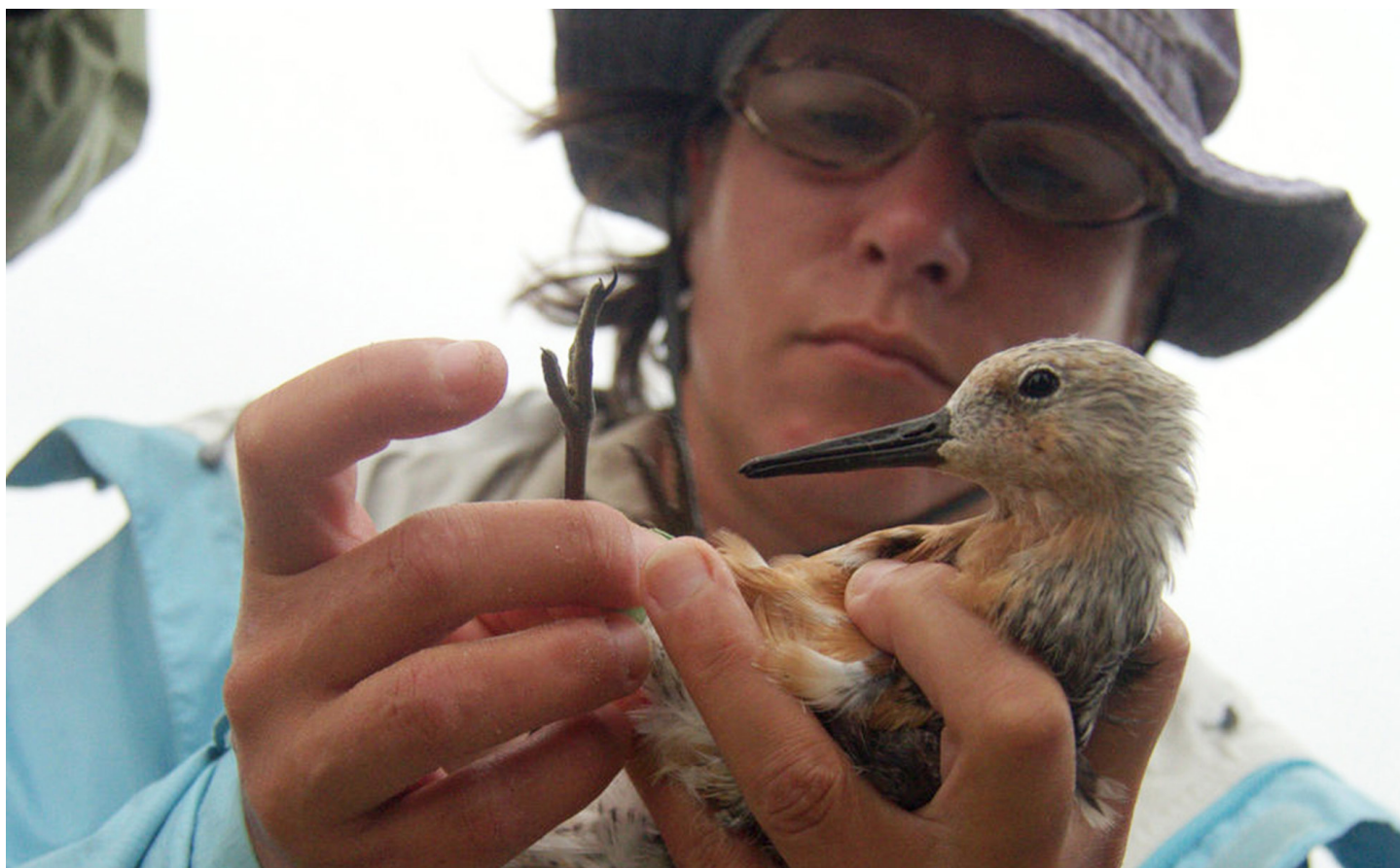
BTNEP supports conservation efforts that monitor migratory birds such as the Red Knot.