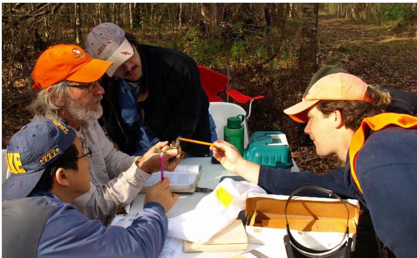
Bird researchers evaluate the health of a migratory bird as part of ongoing monitoring.

The monitoring summary table on the following pages includes the efforts of federal, state, and local government agencies, NGOs, and all partners of BTNEP who are working to collectively implement the CCMP.